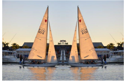
(b) Horizontally mirrored image