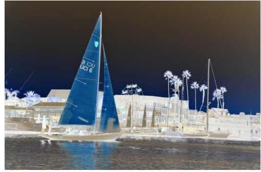
(b) Negative image