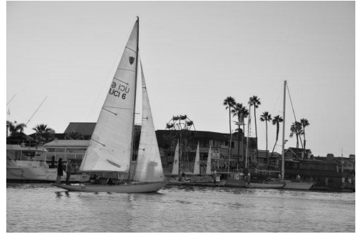
(b) Black and white image