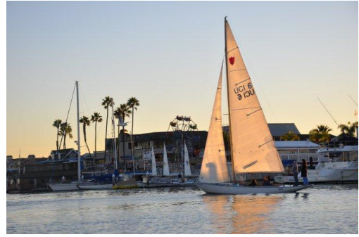
(b) Horizontally flipped image