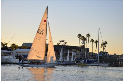
(a) Original image