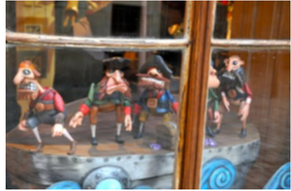
(b) Image with blur