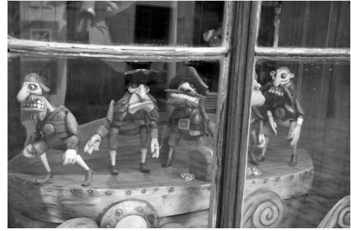
(b) Black and white image