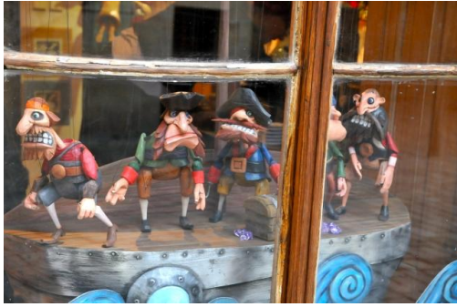
(a) Original image