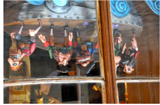
(b) Vertically flipped image