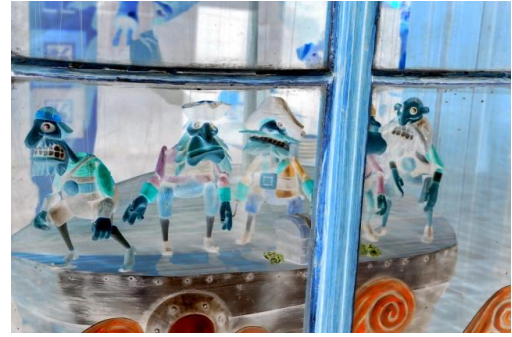
(b) Negative image