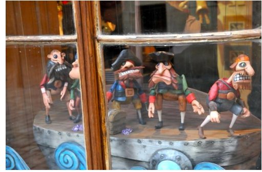
(b) Horizontally flipped image