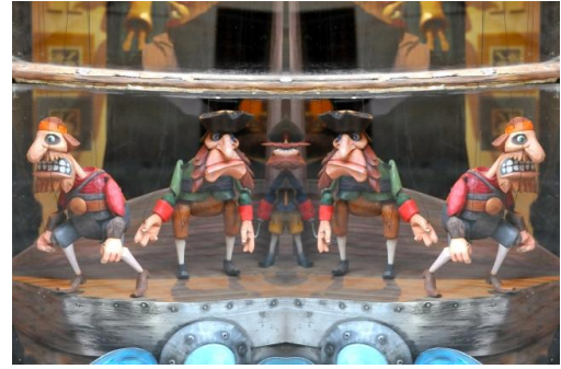
(b) Horizontally mirrored image